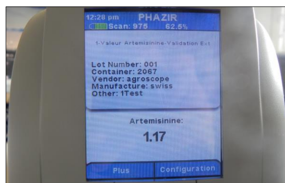
Fig.2. Actual vs. Predicted values of AC (%) using the FT-NIR device (validation).

SEP: standard error of prediction, bias: bias value, SEPC: SEP corrected from bias.