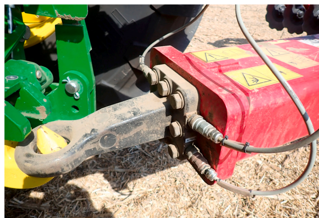
Fig. 3. The cultivator towing eye fitted with a built-in-traction meter to measure forces in three directions.

for 2 s, which gave approximately 1000 measured values per pass on 4.44 m per plot. The measured values were converted to kN.