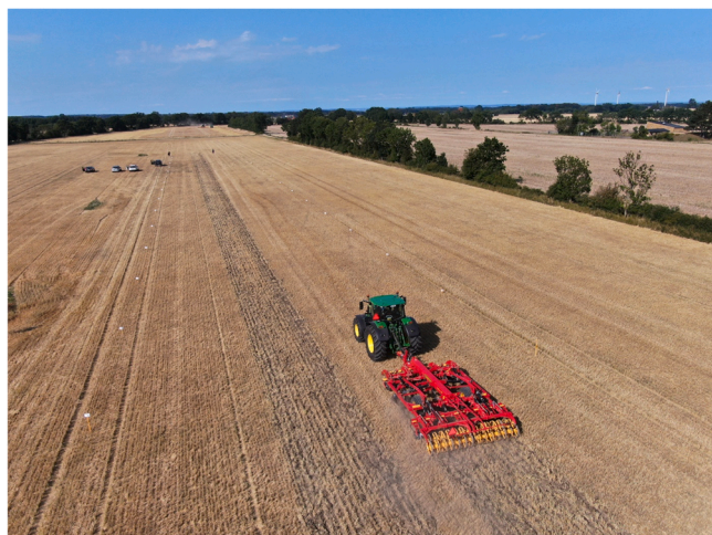
Fig. 2. Draught requirement measurements at the Hulda HP site in August 2020.

At the Kornheddinge site, two passes were made through each experimental plot with the cultivator and during each pass the draught requirement was measured for 3 s, which gave approximately 1500 measured values per pass on 6.67 m per plot. At Stureholm, Skotlandshus and Hulda, four passes were made through each plot with the cultivator and during each pass the draught requirement was measured