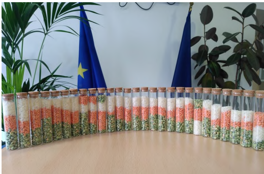
Figure 2. Picture of seed tubes filled by the participants on the last day of the workshop.

Results (Fig. 2) indicate a very high level of satisfaction, given that only five over 27 were 1/5 empty. Furthermore, the second parameter (learning, technology advancement and innovation) was the most variable, likely due to the diversity of backgrounds and experience in HS activity, followed by networking and engagement.