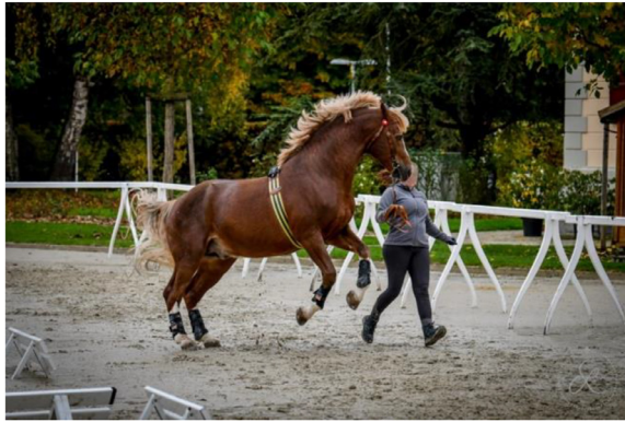
Fig. 10. The horse had to stay at the same gait, without jumping, kicking out or shaking of head.