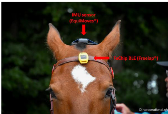
Fig. 4. The IMU head sensor were fixed on a custom-made head piece with Velcro and the FxChip BLE to measure the time of a run was clipped to the browband of the bridle.