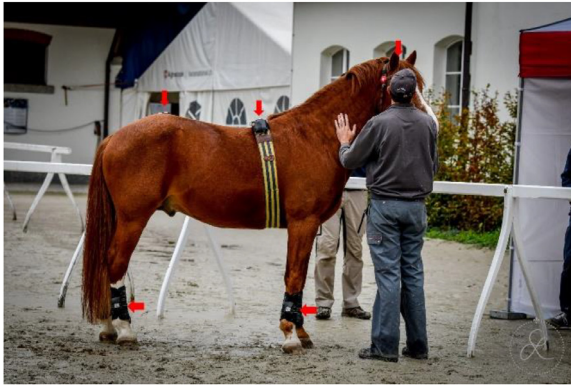
Fig. 3. Horse equipped with the seven IMU sensors from EquiMoves® on the head, withers, sacrum, and limbs shown with red arrows.