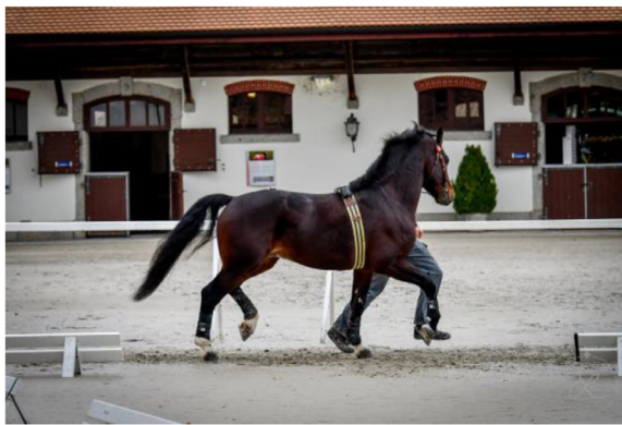
Fig. 11. The handler should not pull the horse towards him as it affects the abduction-adduction angles and trunk posture.