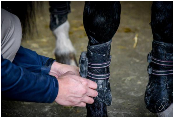
Fig. 8. In case of rain, the IMU sensors were placed in leather pouches to protect them from water damage.