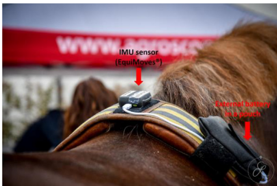
Fig. 5. The girth was equipped with a portable USB battery for the withers sensor with the integrated GNSS-node to prolong battery life.