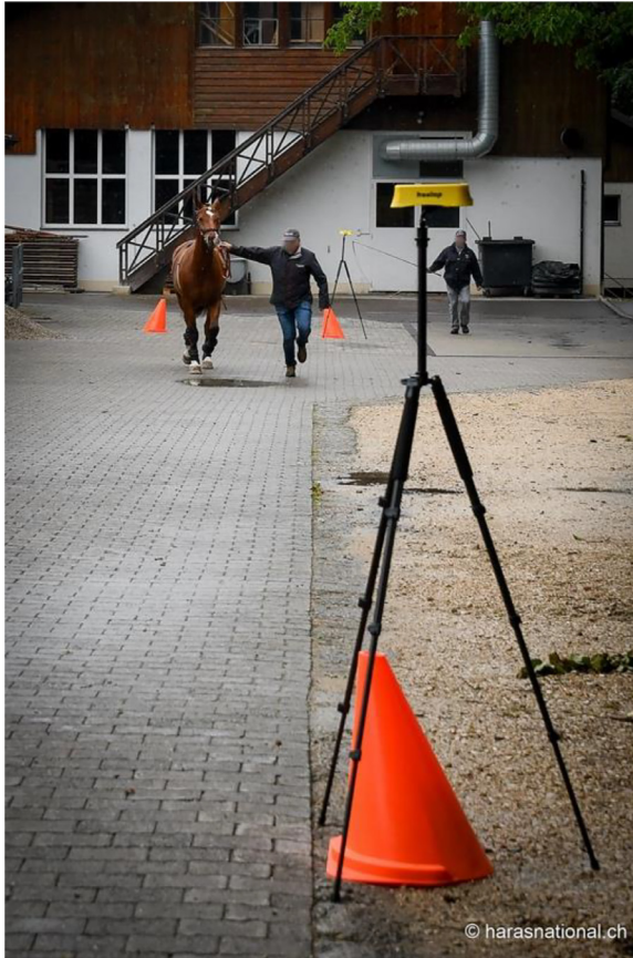
Fig. 2. Typical setup of the data collection. A runway of 35 m, a horse equipped with the EquiMoves® system and the Freelap® sensor, trotted by an experienced handler and encouraged by a second person following the horse.

horses. From the year 2021, with a few exceptions, limb length was additionally measured using a measuring tape from the bony lateral prominence of the lateral collateral ligament elbow joint down to the laterally palpable joint space of the metacarpophalangeal joint. Limb length was not available for 93 horses.