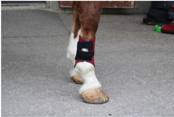
Fig. 7. The limb sensors were fixed with Velcro sewn on the outside of the boot and secured with a double-sided Velcro strap around the boot.