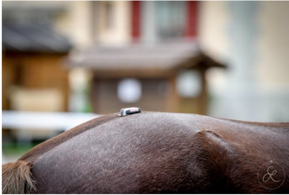
Fig. 6. The sacrum sensor was placed on the tuber sacrale with double-sided sticky tape.