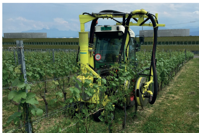
FIGURE 1. Low-pressure double airflow leaf remover (Collard, Bouzy, France) in action at pre-flowering stage (speed 0.6 km/h). Cultivar Gamay, Nyon, Switzerland.

The trial was conducted from 2016 to 2020 in the experimental vineyards of Agroscope in Nyon, Switzerland (46°23'52.4"N 6°13'48.7"E) on the cultivars Doral and Gamay (planted in 2003 and 2007 respectively). For each cultivar, three treatments were applied: 1) mechanical post-berry-set LR, 2) manual pre-flowering LR, and 3) mechanical pre-flowering LR. Manual LR of the cluster area consisted of removing by hand the first six leaves from the base of each shoot, including the leaves of the laterals. Mechanical LR of the equivalent area consisted of using a tractor-mounted compressed-air leaf remover (E 3000 3P, 2003; Collard, Bouzy, France), with different speeds for pre-flowering and post-berry-set treatments. Tractor speed was lower for pre-flowering LR (0.6 km/h) due to the smaller leaf area at that early stage (Figure 1). Field measurements, and leaf and grape analyses were realised. Cluster thinning was completed per treatment at once before bunch closure to match the regional quotas and obtain comparable yields per treatment; wines were made per treatments and then tasted by a panel. Complete material and methods are published in OENO One 57(2) 3 .