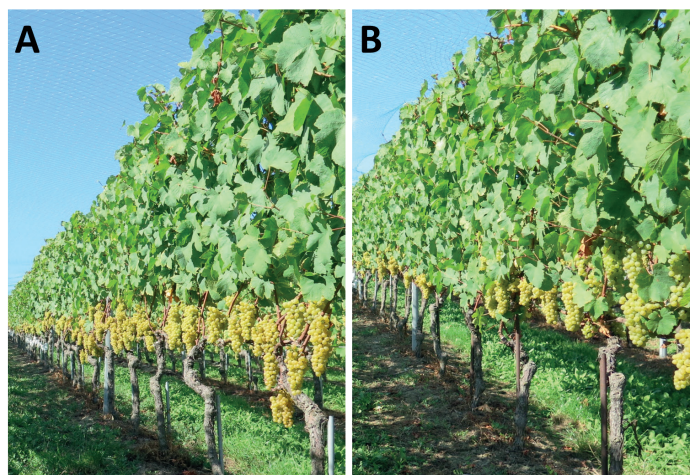
FIGURE 3. Manual (A) versus mechanical (B) pre-flowering leaf removal. Cultivar Doral just before harvest, Nyon, Switzerland. With mechanical LR, lateral shoots were allowed to grow and partially cover the cluster area, while they were completely removed via manual LR.

When compared two-by-two, no difference was observed among Doral wines in terms of sensory analysis, while Gamay wines from mechanical LR tended to be slightly less bitter (-7 %) with smoother tannins (+6 %) than wines from manual LR (both p-values < 0.10).