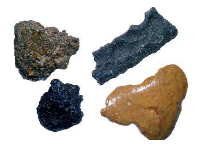
Propolis originate from different plants and have different sensory colour, sensory and chemical properties.

The standard for Brazilian green propolis is cited from the Brazilian bee product legislation (Marchini et al., 2005). The Brazilian green propolis has less total phenolics and flavonoids. Rough adulteration of propolis can be detected by applying these recently published standards. Beeswax is a natural component of propolis, the average amount for poplar propolis ranging from 30 to 40 % (according to the propolis trading company Allwex, Hamburg, personal communication). The geographical authenticity of propolis is not an issue of quality control, but it can be determined by pollen analysis (Ricciardelli d'Albore, 1979).