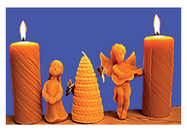
Candles and beeswax figures are popular objects and the customer expects that they are of pure genuine beeswax.

Beeswax is the most important bee product besides honey and apart from its use in beekeeping it is predominately used in cosmetic industry. An update on beeswax quality issues was published recently (Bogdanov, 2004).