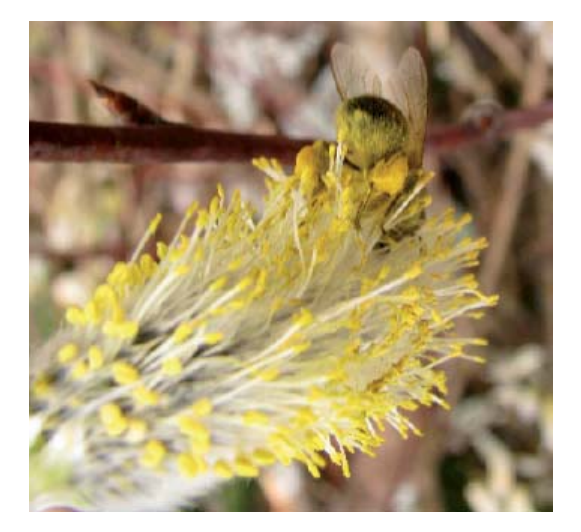
Honey bee foraging pollen on willow

matter, flavour, aroma or taint from foreign matter during harvesting, processing and storage. Honey shall not have started to ferment or effervesce. No pollen or constituent particular to honey may be removed except where this is unavoidable in the removal of foreign inorganic or organic matter. Honey shall not be heated or processed to such an extent that its essential composition is changed and/or its quality impaired.