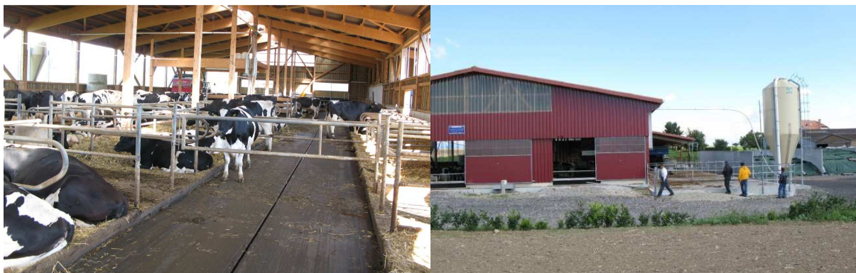
Figure 1: Interior (left) and exterior view (right) of the housing with outdoor exercise area and horizontal silo.

In 2007 a cubicle loose-housing system for 89 dairy cows was built after the due planning-permission process (Figure 1). Once the housing had been in use for about a year, inhabitants of the adjacent residential area filed a joint complaint regarding odour nuisance, whereupon the authorities conducted a survey of the residents of the housing estate in question. Various issues associated with the nuisance situation and its possible causes emerged from the survey. Below, the initial situation in terms of location, housing, management and odour nuisance is explained. In addition to an on-site inspection, planning principles were used to describe and analyse the initial situation. Furthermore, available documents such as meteorological data as well as information from the farm manager and the municipal and cantonal authorities were consulted.