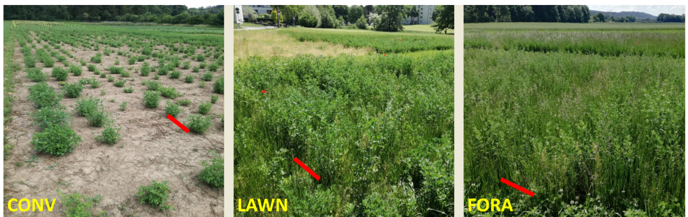
Figure 1. Spaced alfalfa plants in the CONV (bare soil), LAWN (sward with lawn-type grasses), and FORA (sward with forage-type grasses) cultivation systems during the first growth of the second year. Red scale bars indicate the planting distance within rows of 45 cm.

This study is based on 50 different accessions of alfalfa, of which 25 are landraces, ecotypes, or old cultivars (accession 1 to 25) and 25 are currently registered cultivars (accession 26–50, Table S1). In June 2017, pregerminated seeds were sown in the greenhouse and in August, plantlets were transplanted to the field at the Agroscope Reckenholz research station in Zurich, Switzerland (47°25'41" N 8°31'01" E). The spaced alfalfa plants were grown in three cultivation systems: alfalfa plants on bare soil (CONV), alfalfa plants in a sward of shallow growing lawn type grasses (LAWN), and alfalfa plants in a sward of tall growing forage type grasses (FORA) (Figure 1). For the CONV cultivation system, a pendimethalin containing pre-emergence herbicide (Stomp Aqua, BASF, Ludwigshafen, Germany) was applied twice, after planting in 2017 and in spring 2018, to stop weeds from germinating and keep a bare soil. For the LAWN and FORA cultivation systems, seeds of red fescue and tall fescue were sown immediately before planting at a rate of 1 and 1.5 g m -2 , respectively. The used cultivars were red fescue cv. Jasperina and tall fescue cv. Asterix for the LAWN and red fescue cv. Reverent and tall fescue cv. Belfine for the FORA cultivation systems. In addition to red and tall fescue, Kentucky bluegrass ( Poa pratensis L.) cv. Connie (lawn type) was sown in LAWN and FORA plots as this species can fill possible gaps in the sward in case some plants of the fescues disappear.