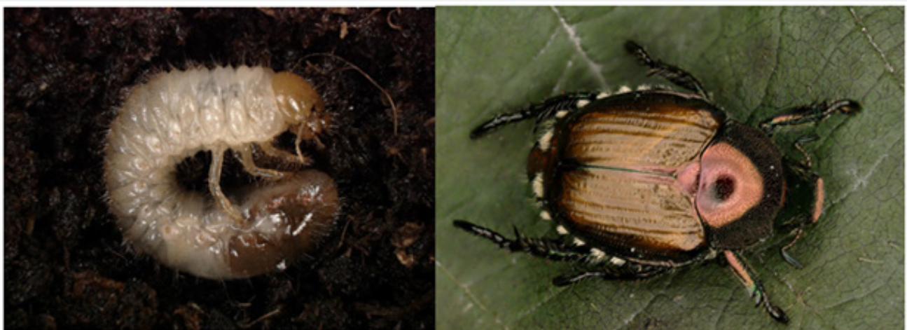
Figure 1: P. japonica larva last instar (L3) (left side) and adult (right side). The larva has a size of about 3 cm and the adult is about 1 cm.

areas and are only identifiable to species level with the help of a stereomicroscope. The adult beetle has bright coppery-brown elytra and a shiny metallic pronotum and head. A row of white tufts on each side of the abdomen is characteristic for this species, and is easily visible with the naked eye (Figure 1).