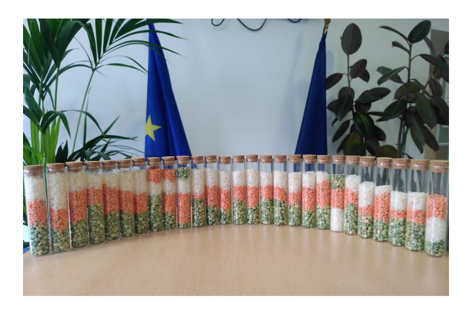
Figure 2. Picture of seed tubes filled by the participants on the last day of the workshop.

Results (Fig. 2) indicate a very high level of satisfaction, given that only five over 27 were 1/5 empty. Furthermore, the second parameter (learning, technology advancement and innovation) was the most variable, likely due to the diversity of backgrounds and experience in HS activity, followed by networking and engagement.