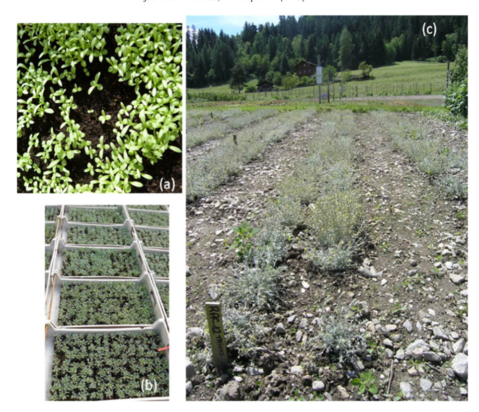
Fig. 1. Cultivation of Artemisia umbelliformis for génépi production goes through growing seedlings (a) and plantlets (b) before planting at a density of 10 plants/m² (c).