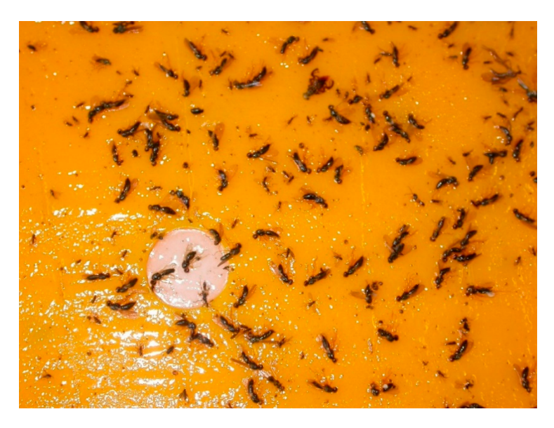
Figure 1. Adult Chamaepsila rosae on Rebell<sup>®</sup> (Andermatt Biocontrol AG, Grossdietwil, Switzerland) sticky trap.

Adult C. rosae can be captured in water traps or on sticky traps but sticky traps are used in most instances (Figure 1). Again, trap colour (usually orange) is important [35]. Finch and Collier [36] also showed that inclining traps at 45° to the vertical made them more attractive to, and selective for, C. rosae , which prefers to land on the lower surface of the trap.