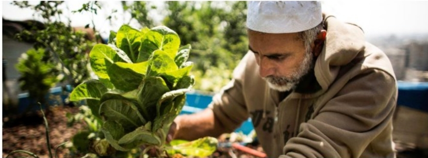
Gaza City, West Bank and Gaza Strip - A beneficiary of a FAO Project tending to the vegetable garden he maintains on the rooftop of his home.