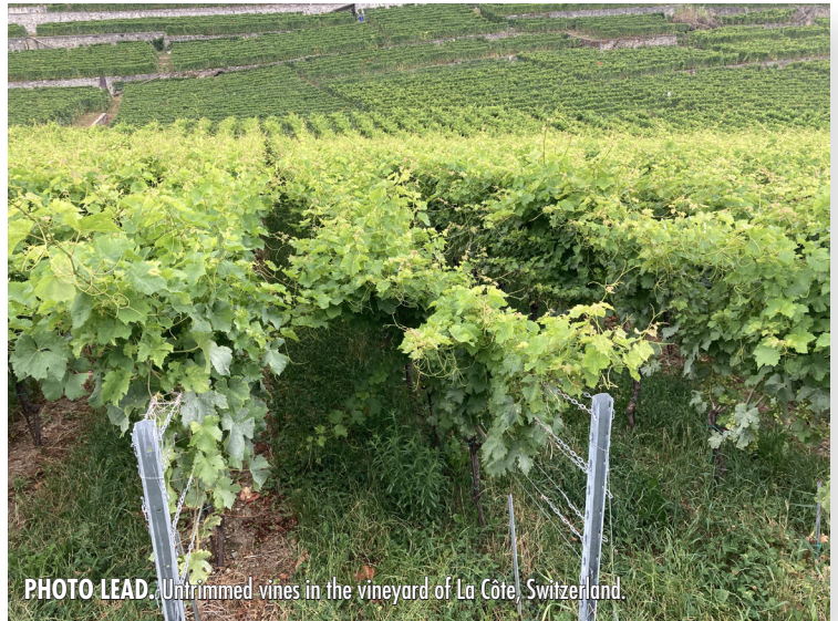
PHOTO LEAD. Untrimmed vines in the vineyard of La Côte, Switzerland.

Delaying the date of the first hedge-trimming (or 'tip-pruning') is of limited technical value in vineyard canopy management. The impact of the delay on lateral shoot growth and must composition remains marginal within the context of the La Côte vineyard in Switzerland.