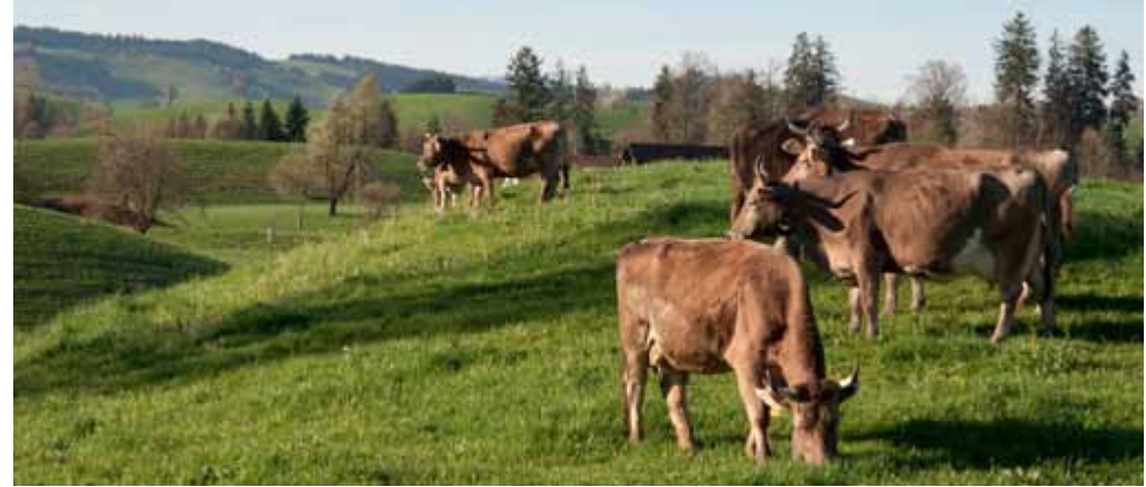
Plant Production Livestock Food Sustainability