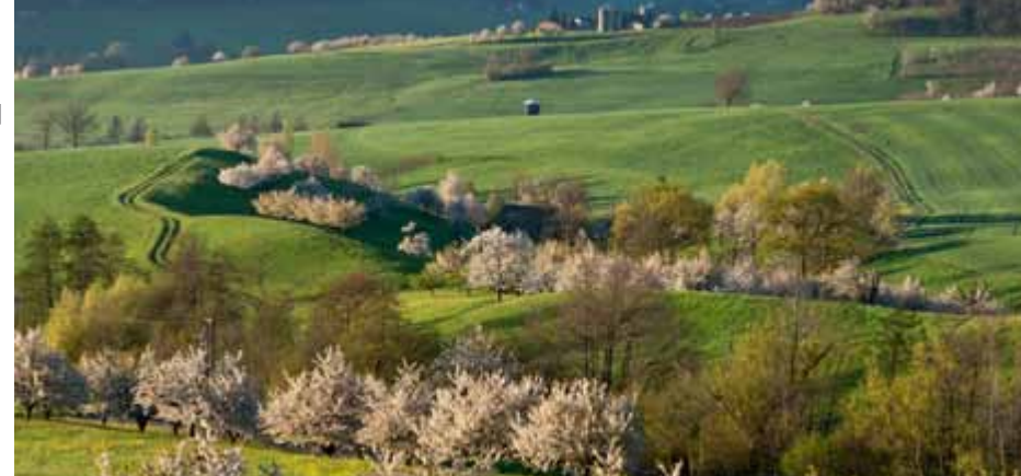
Plant Production Livestock Food Sustainability