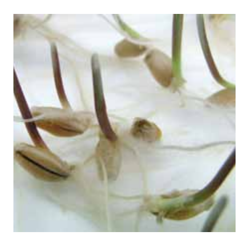
Researching – from Seed to Harvest