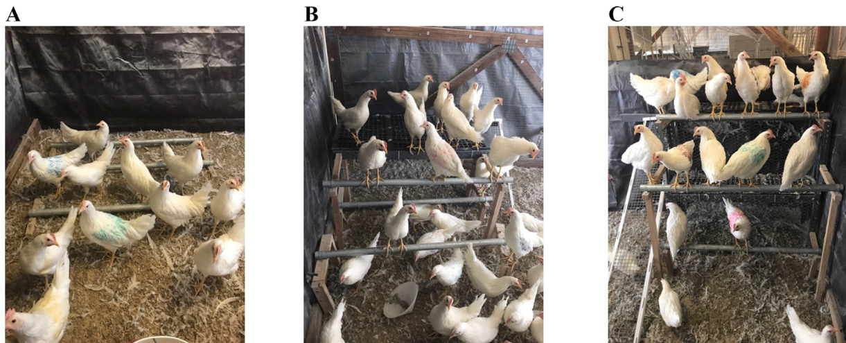
Figure 1. Female Dekalb White pullets were reared in 1 of 3 environments for the first 16 wk of life: floor rearing environment with 10 cm high floor perches (A), a single-tiered aviary with 3 elevated perches and 1 elevated tier (B), and 2-tiered aviary with 3 elevated perches and 2 elevated tiers (C). Pullets were reared in groups of 55 to 56 pullets/pen from 1 d to 8 wk of age, then 45 pullets/pen from 8 to 16 wk of age ( n = 5 pens/rearing environment). Pullets were 16 wk of age at the time of the photographs.

To keep the accessible space allowance constant across the rearing environments, chicken wire was used to prevent pullets from accessing the litter area directly